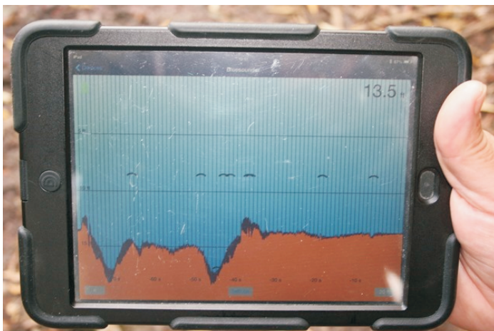
Bluesounder app running on an iPad mini (in a ruggedised enclosure)