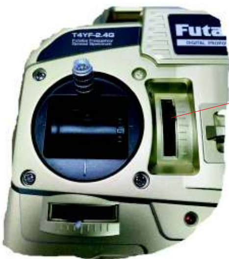
Left-hand joystick with Horizontal trim three quarters up